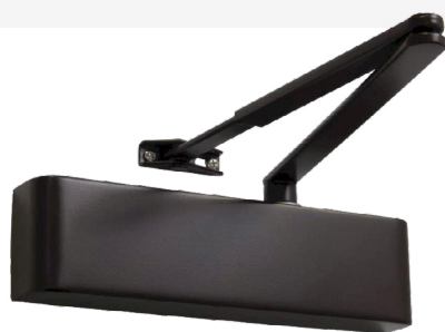
^ The Rutland TS.9205 Scissor Arm Door Closer is power-adjustable from EN2-5

In fact, it is perfectly possible to fit closers to half-leaf doors. The skill is in knowing, given the variety of sizes of half-leaf doors that exist, which specific closer is best in each situation. The space available for closing mechanisms and the power required to close different sizes of door are the key factors to consider.