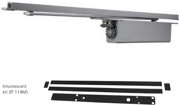
Intumescent kit (IP.114M)