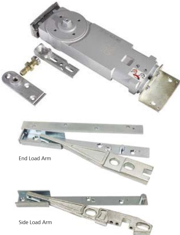
End Load Arm