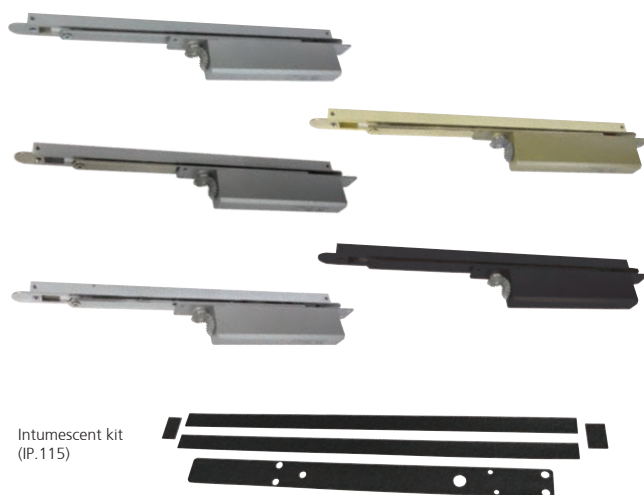
Intumescent kit (IP.115)